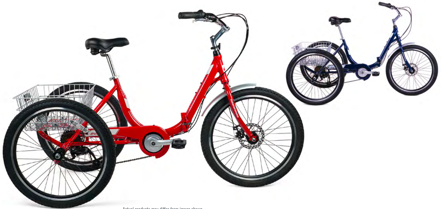
Actual products may differ from image shown.

The Latitude is a great choice for exercise or just to feel the simple joy of riding again. Riders who struggle with balance or just want the security that comes from three wheels on the ground will find this 8-speed trike equally handy for getting around the neighbourhood and for longer rides to the store.