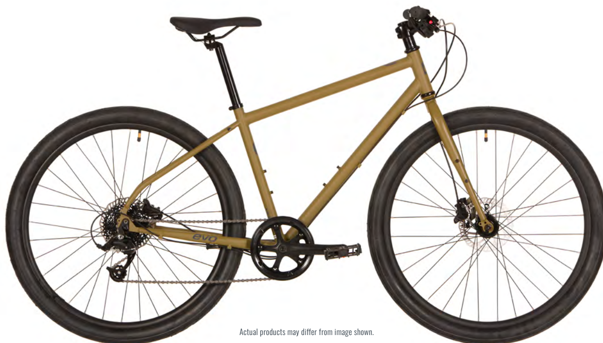
Actual products may differ from image shown.

TRNST is built for the abuse of rough city streets. With a chromoly steel frame and high-volume 27.5" tires, TRNST can take whatever the city dishes out and keep coming back for more.